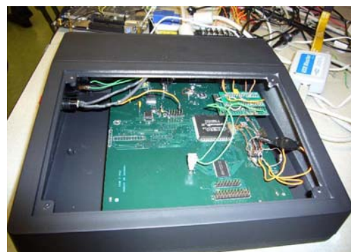
Figure 2 PCB in Packaging

Figure 1 identifies the major components and architecture of the system. An Altera Cyclone II™ FPGA is configured to support a NIOS II soft core processor along with custom logic used primarily for video processing. An opto-isolator and MIDI connector provide the hardware portion of the MIDI interface to the microprocessor. An ISP1181A USB controller enables in-circuit programming of the FPGA. An